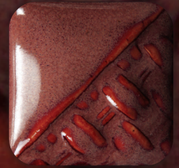
SW-113 Speckled Plum