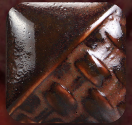
SW-113 Speckled Plum