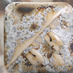
SW-155 Winter Wood