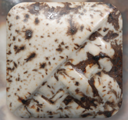
SW-155 Winter Wood