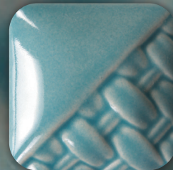
SW-211 Glacier Blue