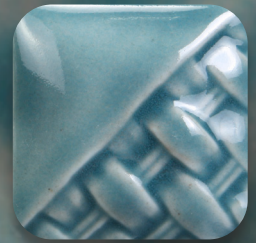
SW-211 Glacier Blue