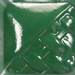
SW-509 Dark Green Gloss