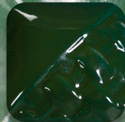
SW-509 Dark Green Gloss