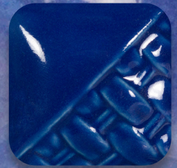
SW-510 Blue Gloss