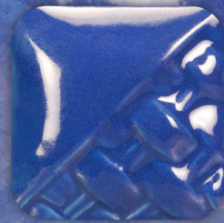
SW-510 Blue Gloss