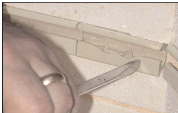
The holder shown with about half the job done:

Just take your time with this. You can break the holder into little pieces so that it comes out: