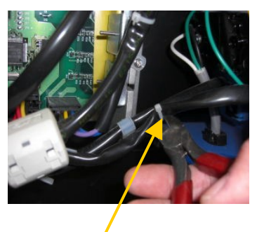
Cut the zip tie to release cables that are zip tied together.