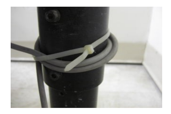
WRAP THE PEDAL CORD SEVERAL TIMES AROUND ONE OF THE FRONT LEGS AND SECURE WITH A ZIP TIE.