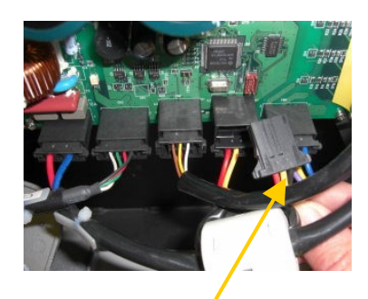
Unclip the other end of the potentiometer from the control board by squeezing the sides of the clip and pulling