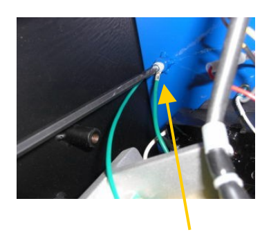
Re-screw the green ground wire on