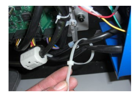
Put on a new zip tie to hold all wires together.