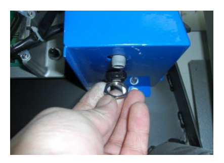
Place the new potentiometer harness in the hole on the blue panel and tighten on with washer