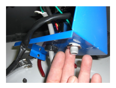
Plug in the foot pedal cord