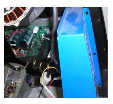
In order to take off the part, the blue panel must be removed in order to unscrew the green ground wire.