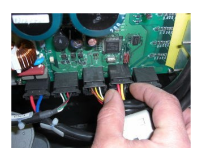
Clip in the new harness to the control panel