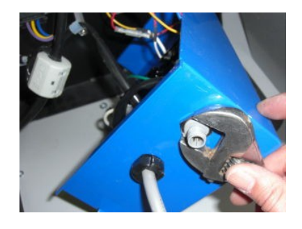
Remove the metal washer from the plastic screw end of the harness