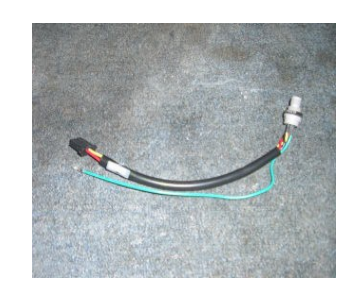
Part #: FRKB3018030 Potentiometer Harness