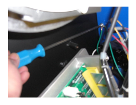
Once you have removed the control board or the blue panel, unscrew the green ground wire.