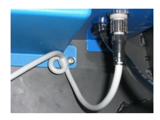
ATTACH A ZIP TIE TO THE OUTSIDE OF THE BLUE PANEL SECUREING THE FOOT PEDAL CORD