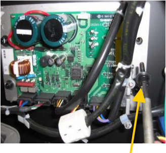
In order to take off the part the control board must be removed to in order to unscrew the green ground wire